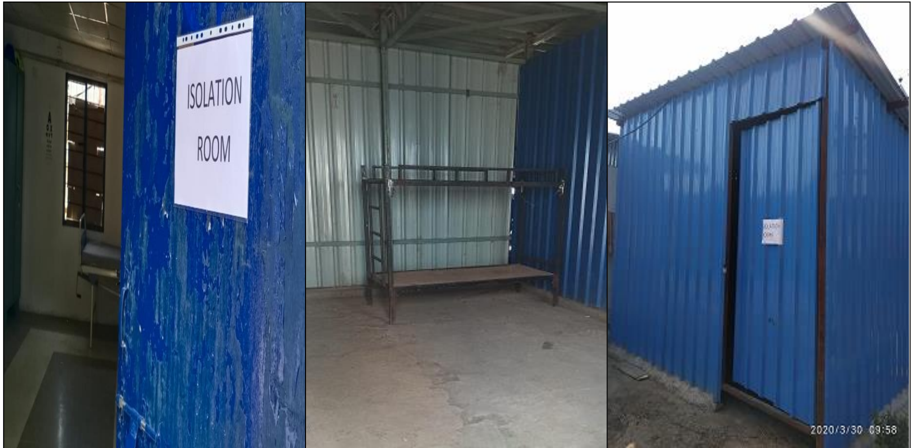
Isolated Room at CIMS Chhindwara

Total 140 Rooms are kept vacant at labor colony for Quarantine facilities.