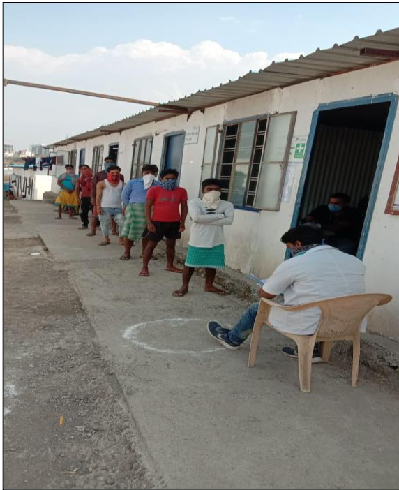
Doctor Visit @ Solitare

Daily screening is going on with the help of male Paramedic and Camp Boss