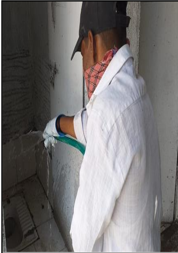
Toilet Cleaning @ SPI7

Janitor cum Sweeper are deployed for House keeping. Doing Pest Control weekly.