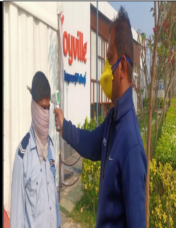
Screening by Sec. Sup at Joyville Hinjewadi