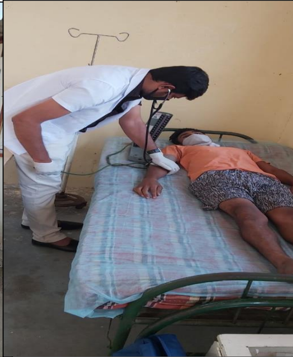
Doctor Visit at SPI7