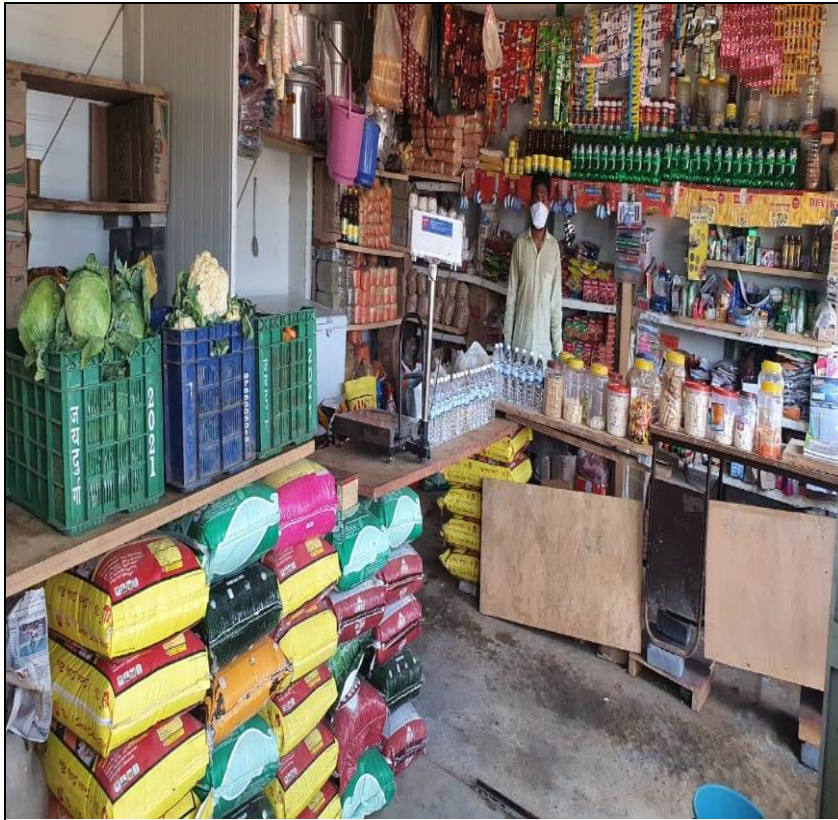
Fully Stocked Grocery shop at GMC Chandrapur

Grocery shop erected in a colony and shop owner stocked sufficient grocery for next 20 days. Arranging Sabji mandi two times in week at a colony