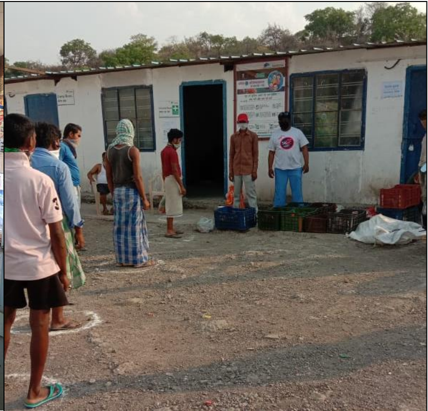
Weekly Sabji Mandi at Solitare