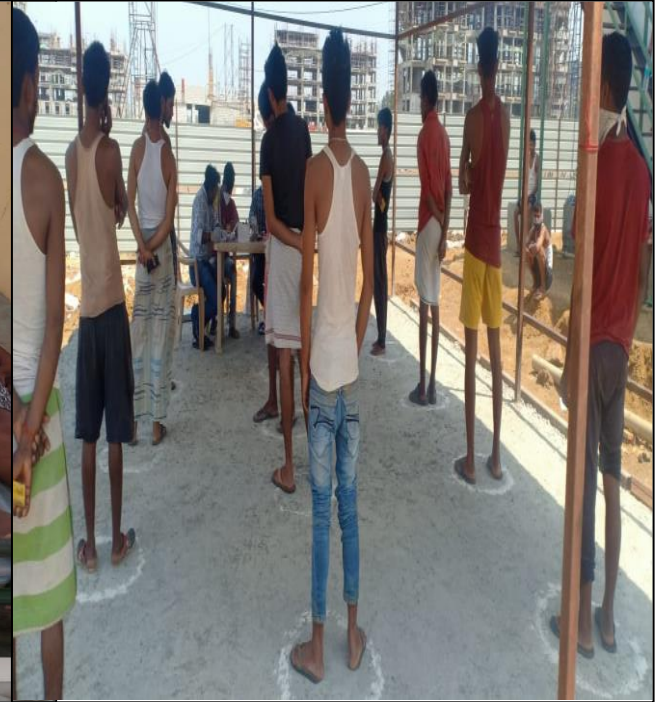
Doctor visit @ GMC Chandrapur