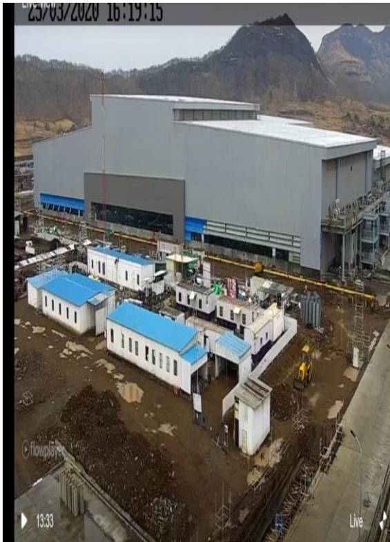
CCTV Monitoring for Emerson

Assuring site security thru 51 Nos Guards in a day, 59 Nos Guards at Night & 15 Nos Supervisor. Monitoring CCTV Surveillance System, screening on daily basis.