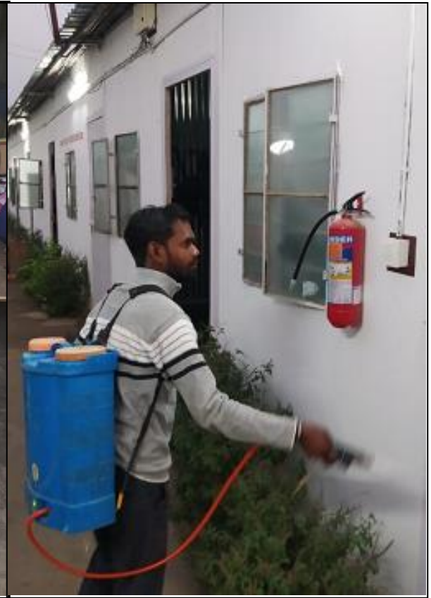
Pest Control @ Joyville Hinjewadi