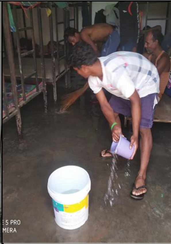
Room Cleaning at SPI7