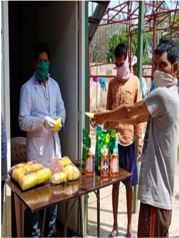
Mask & hand Wash distribution at CIMS Chhindwara

Provided Mask, Sanitizer and common Hand Wash facilities