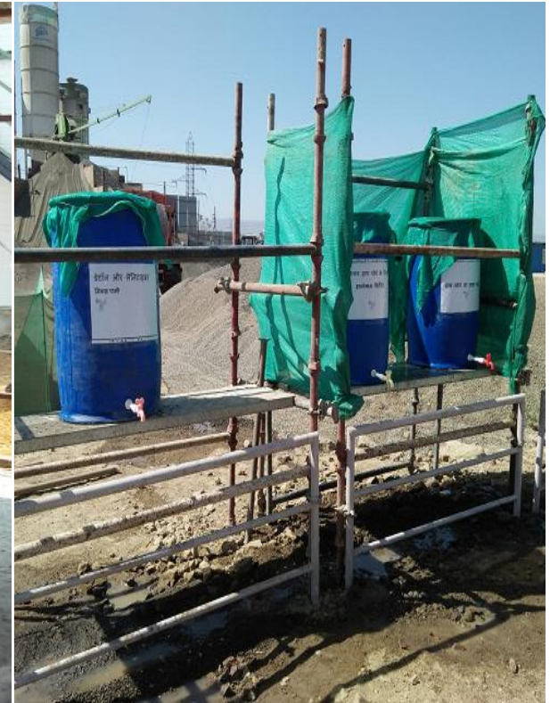
Common Hand Wash facilities at Joyville Hinjewadi