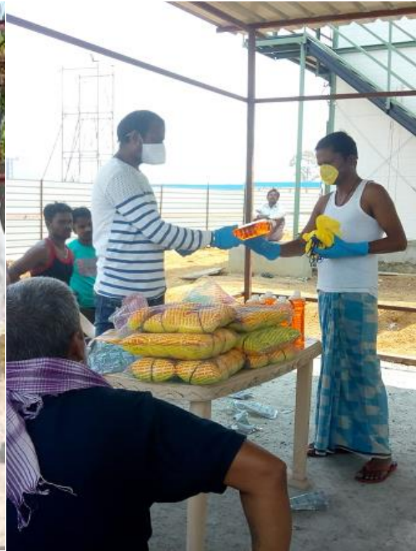
Mask & hand Wash distribution at Emerson Chakan